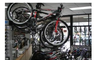
Sycamore Bicycle Shop