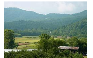
Gaia Herb Farm